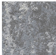
Cliff 15530 LRV 14.9 | L* 45.43