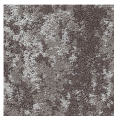
Canyon 15180 LRV 16.3 | L* 47.34