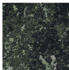
Moss 15326 LRV 6.6 | L* 30.81