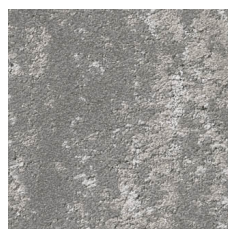
Dune 15105 LRV 18.7 | L* 50.34