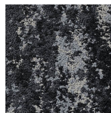
Vast 15505 LRV 4.7 | L* 25.84