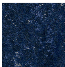
Coast 15456 LRV 3.8 | L* 22.94