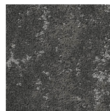
Slope 15518 LRV 6.4 | L* 30.51