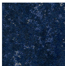
Coast 15456 LRV 3.8 | L* 22.94