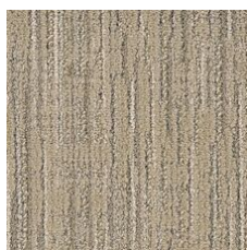
Sand Dollar 19110