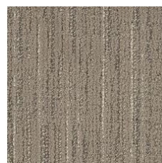
Hot Spring 19510