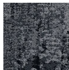
Raven 35505 LRV 8.1 | L* 34.26