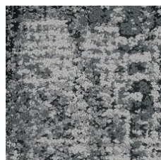
Fog 35518 LRV 15.6 | L* 46.51