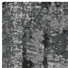
Rainstorm 35535 LRV 15.9 | L* 46.87