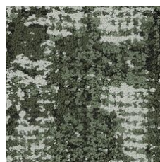
Ivy 35375 LRV 15.7 | L* 46.61