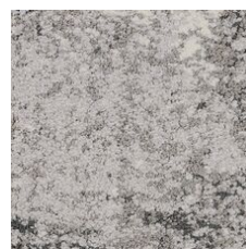
Greige 35516 LRV 36.9 | L* 67.23