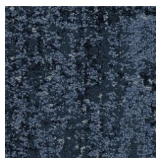
Overdye 35496 LRV 8 | L* 34