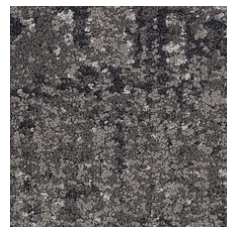
Truffle 35760 LRV 12.3 | L* 41.77