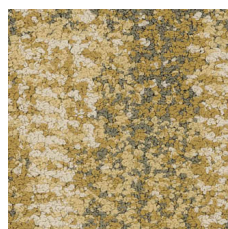
Golden 35210 LRV 29.7 | L* 61.42