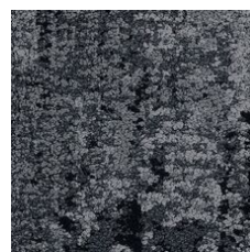
Raven 35505 LRV 8.1 | L* 34.26