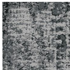
Fog 35518 LRV 15.6 | L* 46.51