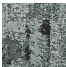
Mint 35327 LRV 21.8 | L* 53.81