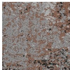
Apricot 35675 LRV 19.4 | L* 51.1