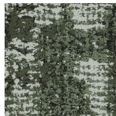
Ivy 35375 LRV 15.7 | L* 46.61