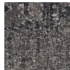
Truffle 35760 LRV 12.3 | L* 41.77