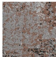
Apricot 35675 LRV 19.4 | L* 51.1