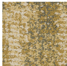
Golden 35210 LRV 29.7 | L* 61.42