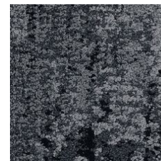
Raven 35505 LRV 8.1 | L* 34.26