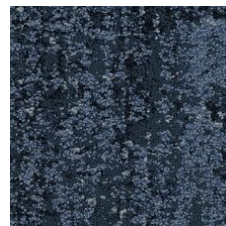
Overdye 35496 LRV 8 | L* 34