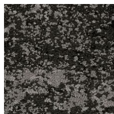
Espresso 35585 LRV 10.7 | L* 39.15