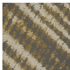
Golden 35210 LRV 23.3 | L* 55.33