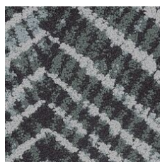
Mint 35327 LRV 17.9 | L* 49.38