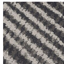
Truffle 35760 LRV 12.5 | L* 41.93