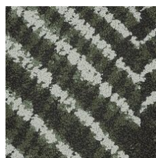
Ivy 35375 LRV 15.4 | L* 46.19