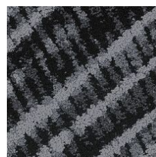
Raven 35505 LRV 8.4 | L* 34.8