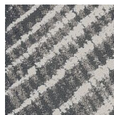
Greige 35516 LRV 32.5 | L* 63.76