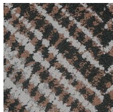
Apricot 35675 LRV 18.9 | L* 50.53