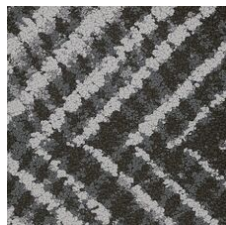
Rainstorm 35535 LRV 14.9 | L* 45.54