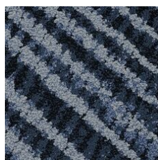
Overdye 35496 LRV 11.4 | L* 40.29