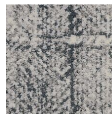
Greige 35516 LRV 33.3 | L* 64.43