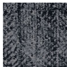
Raven 35505 LRV 7.6 | L* 33.11