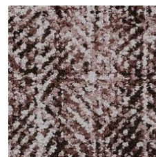
Rosewood 35870 LRV 17.1 | L* 48.39