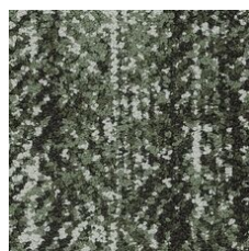
Ivy 35375 LRV 14.8 | L* 45.31