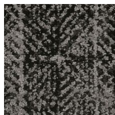
Espresso 35585 LRV 9.6 | L* 37.2