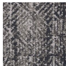
Truffle 35760 LRV 14 | L* 44.27