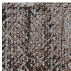
Apricot 35675 LRV 17.2 | L* 48.48