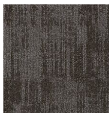
Link 67555 LRV 9.7 | L* 37.21