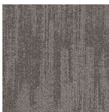
Interaction 67515 LRV 19.6 | L* 51.34