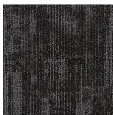
System 67505 LRV 6.6 | L* 30.84