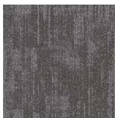
Network 67535 LRV 16.5 | L* 47.64