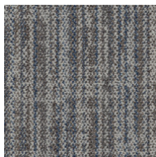
Vibrant Tejate 25486 LRV 19.8 | L* 51.62