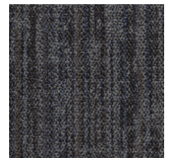
Vibrant Mole 25485 LRV 6.8 | L* 31.28