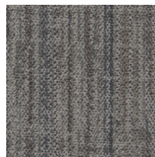
Agave 25535 LRV 15.9 | L* 46.82