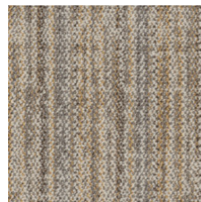
Vibrant Maiz 25210 LRV 32.9 | L* 64.07