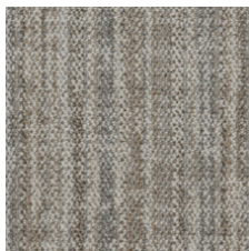
Native 25105 LRV 30.8 | L* 62.38