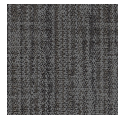
Retreat 25580 LRV 9.5 | L* 36.92