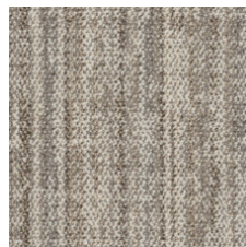
Maiz 25111 LRV 31.3 | L* 62.78