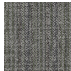
Vibrant Agave 25375 LRV 16.4 | L* 47.48