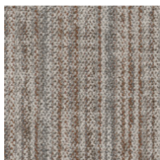
Vibrant Native 25675 LRV 28.1 | L* 59.97