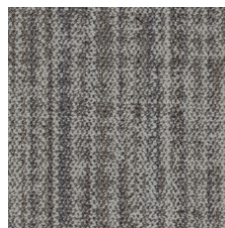
Tejate 25518 LRV 21.9 | L* 53.87