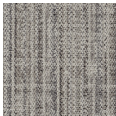
Cobblestone 25100 LRV 27.7 | L* 59.58