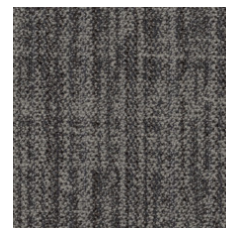
Immerse 25555 LRV 12.1 | L* 41.4