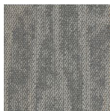
Reset 93535 LRV 23.3 | L* 55.34