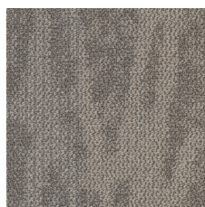
Thoughtful 93515 LRV 19.3 | L* 51.04