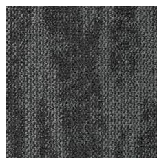
Brainstorm 93500 LRV 7.6 | L* 33.08