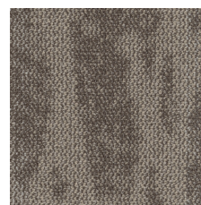
Peptalk 93760 LRV 16 | L* 46.92