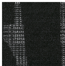
Exclaim 05500 LRV 2.7 | L* 18.7