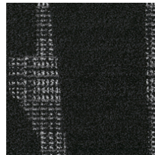
Exclaim 05500 LRV 2.7 | L* 18.7