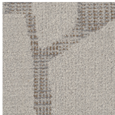
Listen 05100 LRV 31 | L* 62.52