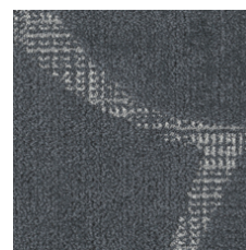
Express 05580 LRV 8.7 | L* 35.43