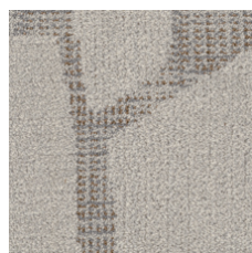
Listen 05100 LRV 31 | L* 62.52