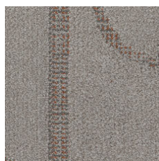
Connection 05105 LRV 24 | L* 56.1