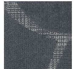
Express 05580 LRV 8.7 | L* 35.43