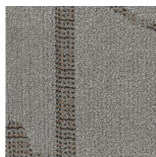
Story 05111 LRV 16.3 | L* 47.34