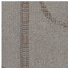
Connection 05105 LRV 24 | L* 56.1