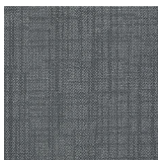
Blue Herring 17481