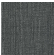
Storm Cloud 17597