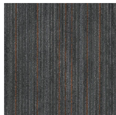
→ Action Terracota 57587

→ Quick Ship 2 semanas: hasta 2,500 yardas cuadradas desde EE. UU.