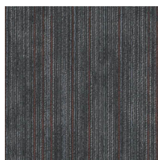
→ Action Burgundy 57582