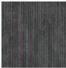
Action Burgundy 57582