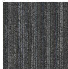
Action Blue 57584