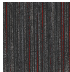
Action Garnet 57585