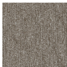
Impact 97100 LRV 21.7 | L* 53.7