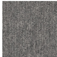
Influence 97535 LRV 17.6 | L* 48.99