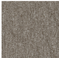
Impact 97100 LRV 21.7 | L* 53.7