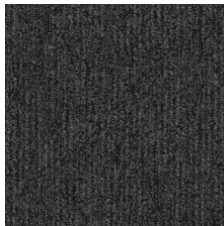
Contribute 97500 LRV 4 | L* 23.79