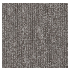
Progress 97515 LRV 18.5 | L* 50.1