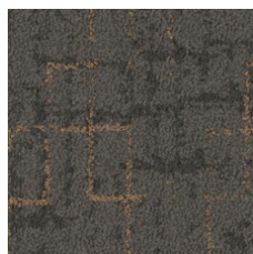
Flint 84761 LRV 8.1 | L* 34.11