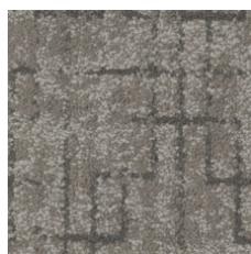
Granite 84105 LRV 20.6 | L* 52.54