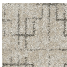
Marble 84100 LRV 42.7 | L* 71.34