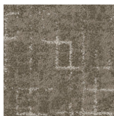
Clay 84506 LRV 16.6 | L* 47.75