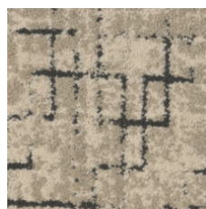
Pebble 84111 LRV 39 | L* 68.77