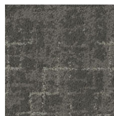
Slate 84518 LRV 13.2 | L* 43.08