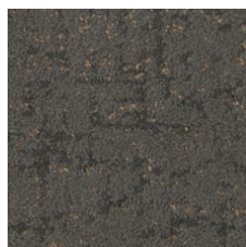
Flint 84761 LRV 8.5 | L* 35