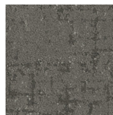
Slate 84518 LRV 14.3 | L* 44.64