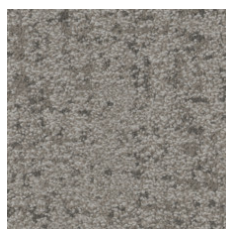
Granite 84105 LRV 22.2 | L* 54.2