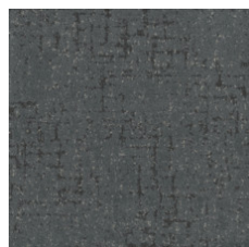
Graphite 84580 LRV 9.7 | L* 37.37