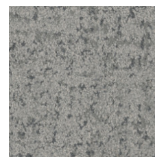
Mineral 84535 LRV 25.8 | L* 57.84