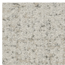
Marble 84100 LRV 44 | L* 72.25