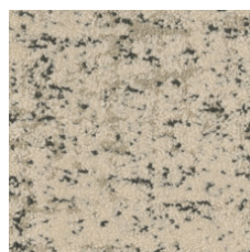
Pebble 84111 LRV 41.3 | L* 70.37