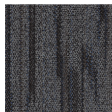
Vibrant Mole 25485