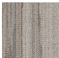
Vibrant Native 25675