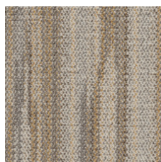
Vibrant Maiz 25210