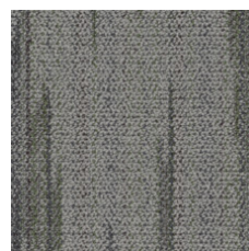
Vibrant Agave 25375