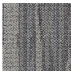
Vibrant Tejate 25486