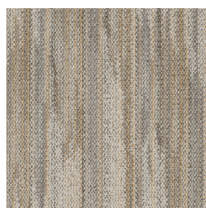
Vibrant Maiz 25210