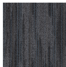
Vibrant Mole 25485