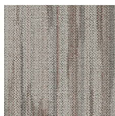
Vibrant Native 25675