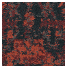
Estate 31850 LRV 7.4 | L* 32.80