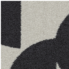
Screen Print 32100

Carpet Tile: Apollo Tile, Atticus Tile, Delphi Tile, Agnes Tile, Lenore Tile, Jackson Tile, Sheila Tile, Gustav Tile, Pierre Tile, Andy Tile, Annie Tile, Kelly Tile, Marli Tile, Otti Tile, Josef Tile, Keith Tile