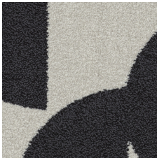
Screen Print 32100

Carpet Tile: Apollo Tile, Atticus Tile, Delphi Tile, Agnes Tile, Lenore Tile, Jackson Tile, Sheila Tile, Gustav Tile, Pierre Tile, Andy Tile, Annie Tile, Kelly Tile, Marli Tile, Otti Tile, Josef Tile, Keith Tile