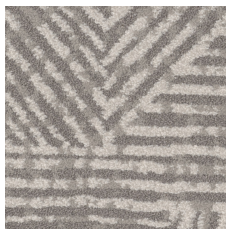
Wool 38100 LRV 34.8 | L* 65.55