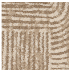
Jute 38111 LRV 37.0 | L* 67.25