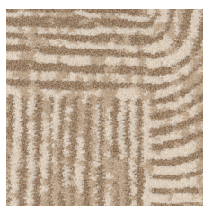
Jute 38111 LRV 37.0 | L* 67.25