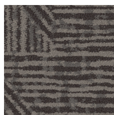
Shetland 38555 LRV 9.5 | L* 36.97