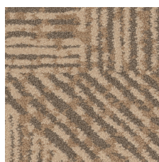
Flax 38770 LRV 24.6 | L* 56.66

3rd Party Certified in Accordance with ISO14044, ISO14025 & EN15804 C2C Silver Level (Version 4.0) or HPD (Version 2.1)