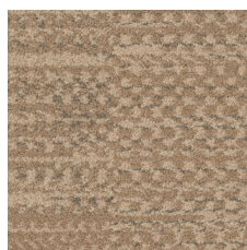
Flax 38770 LRV 11.6 | L* 40.62