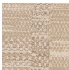
Jute 38111 LRV 42.0 | L* 70.89