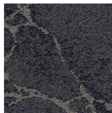
Lazurite Silver 21496 LRV 5.8 | L* 28.97