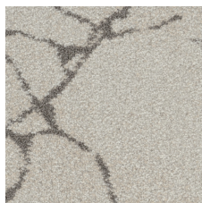
Carrara Silver 21100 LRV 41.1 | L* 70.27