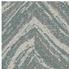
Jade Palladium 21327 LRV 28.1