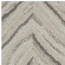
Carrara Silver 21100 LRV 36.5