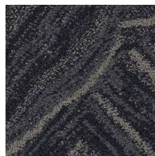
Lazurite Silver 21496 LRV 6.0