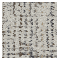
Untitled 24105 LRV 39.4 | L* 69.03