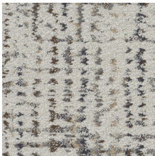
Untitled 24105 LRV 39.4 | L* 69.03