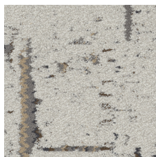
Untitled 24105 LRV 40.0 | L* 69.49