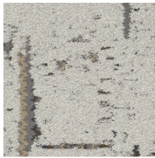
Untitled 24105 LRV 40.0 | L* 69.49