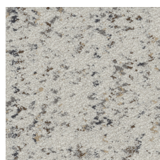
Untitled 24105 LRV 41.4 | L* 70.49