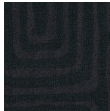
Cornflower 28480 LRV 3.8