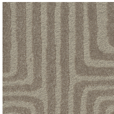
Frieze 28111 LRV 27.9