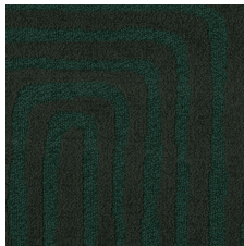
Garden 28369 LRV 4.4