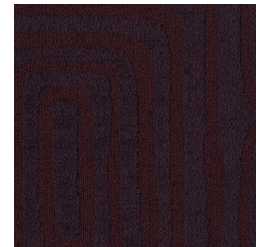
Plum 28962 LRV 3.2