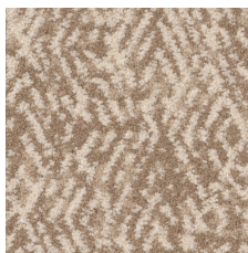
Jute 38111 LRV 34.6 | L* 65.41