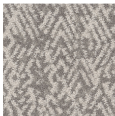
Wool 38100 LRV 36.5 | L* 66.93