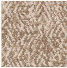
Jute 38111 LRV 34.6 | L* 65.41