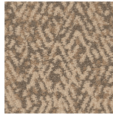
Flax 38770 LRV 26.2 | L* 58.24