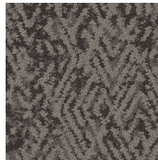
Shetland 38555 LRV 11.5 | L* 40.48