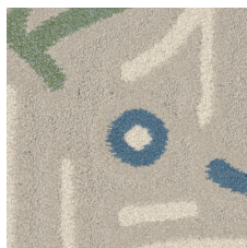
Fresco 42411 LRV 39.8