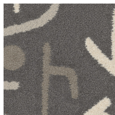
Graphite 42518 LRV 15.7