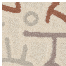
Pastel 42675 LRV 47.1