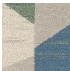
Fresco 42411 LRV 36.8