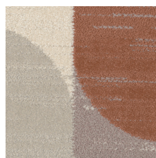
Pastel 42675 LRV 34.4