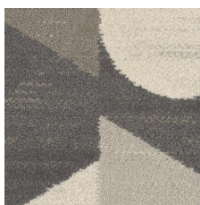
Graphite 42518 LRV 43.6