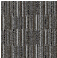
Metal Grey 51585