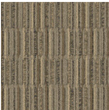
Wheat Field 51755