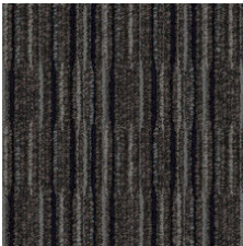
Chimney Black 51500