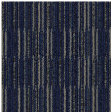
Blue Ink 51485