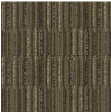
Forest Green 51330