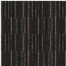
Black Ice 51505