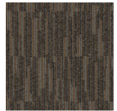
Cast Bronze 92601