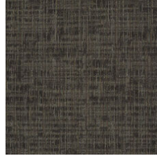
Canyon 83750 LRV 4.7 | L* 25.88