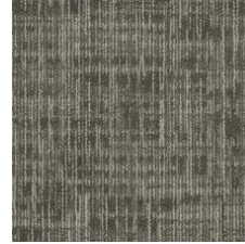
Clay 83761 LRV 10.3 | L* 38.44