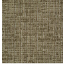
Suede 83755 LRV 11.9 | L* 41.05