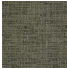
Swept 83322 LRV 7.5 | L* 32.81