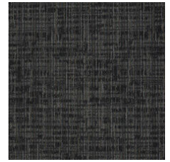
Underground 83505 LRV 3.7 | L* 22.49