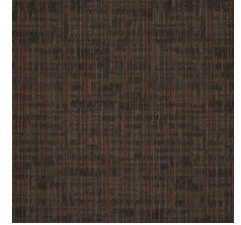
Brazen 83803 LRV 3 | L* 23.45