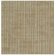
Cork 83170 LRV 18.8 | L* 50.46