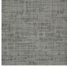
Zinc 83515 LRV 13.8 | L* 43.96