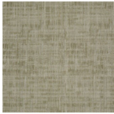
Bisque 83111 LRV 17.8 | L* 49.26