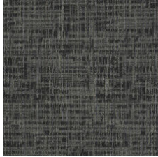
Carbon 83585 LRV 5.8 | L* 28.85